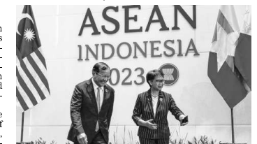
Indonesia's Foreign Minister Retno Marsudi welcomes her Cambodian counterpart Prak Sokhonn in Jakarta on Friday

Southeast Asian foreign ministers met in Indonesia's capital Friday for talks overshadowed by the deteriorating situation in military-ruled Myanmar despite an agenda focused on food and energy security and cooperation in finance and health.